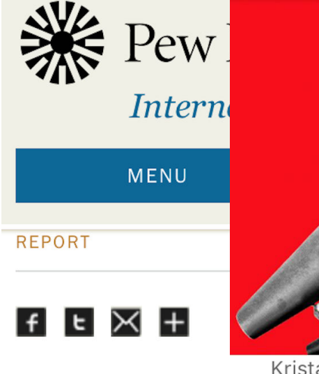
OCTOBER 19, 2017